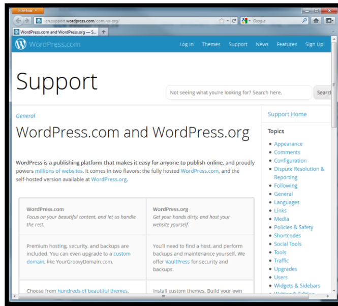
Figure 1 Screenshot of the Support: WordPress.com and WordPress.org webpage.

Support: WordPress.com and WordPress.org