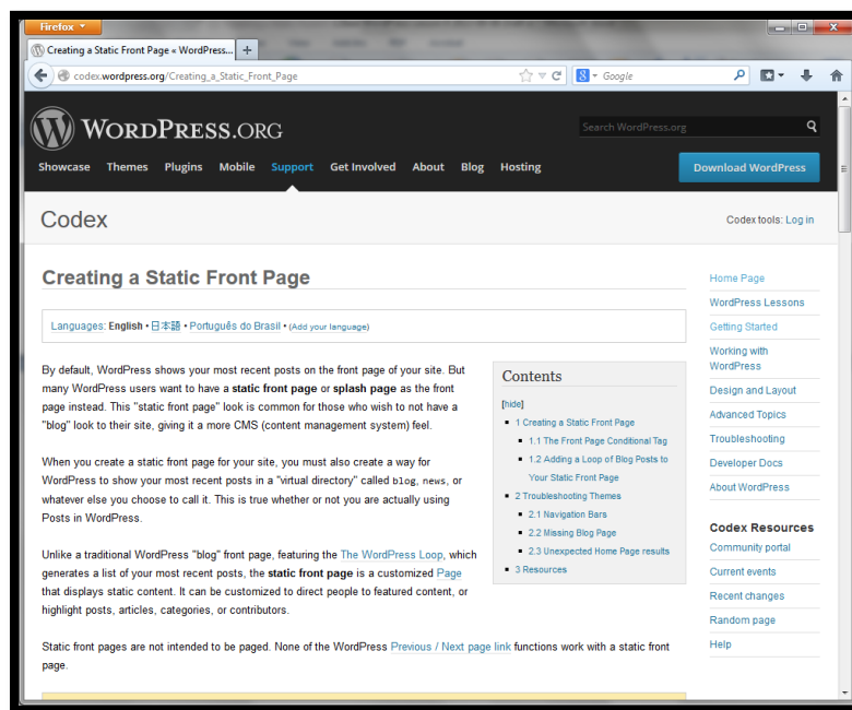
Figure 1 WordPress

2. Next, watch the Bluehost.com video on how to create a static page: