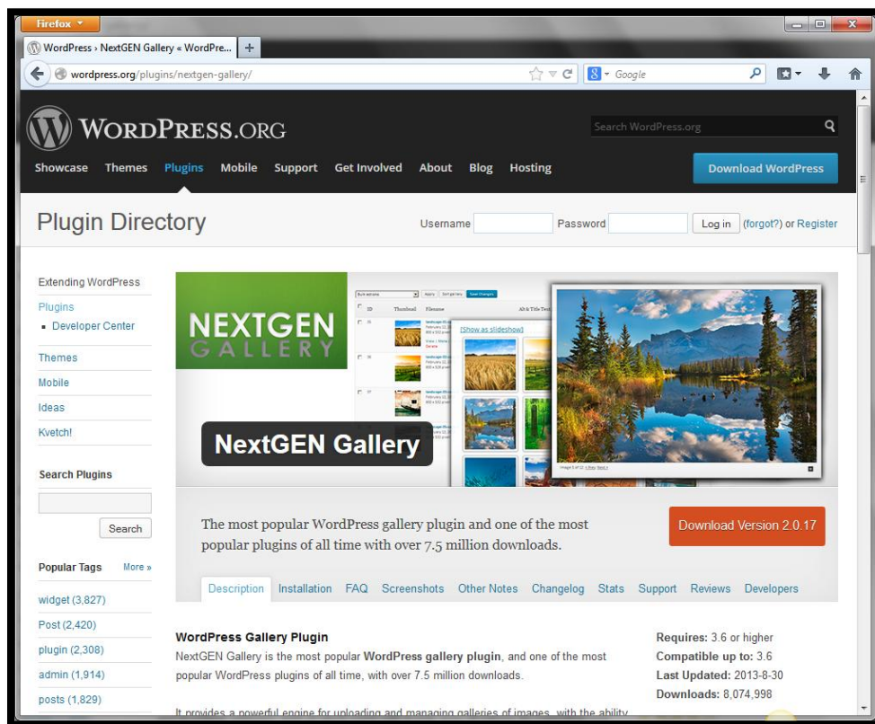
Figure 1 WordPress Nextgen Gallery

Images are a huge part of any blog or website. You need to have a Plugin that will help you manage and display your images (graphics, clip art, etc.). You will be installing and using the NextGEN Gallery Plugin :